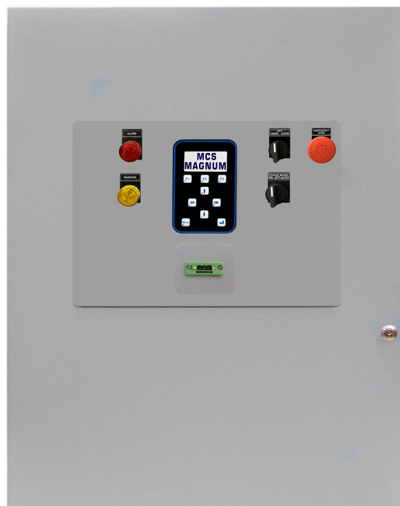
Photo shows MCS-RS-485-Extender mounted on front of enclosure

Ship Weight ..... 0.51 lb (approx) Box Dimensions..... 6 x 5.25 x 3.25 (approx)